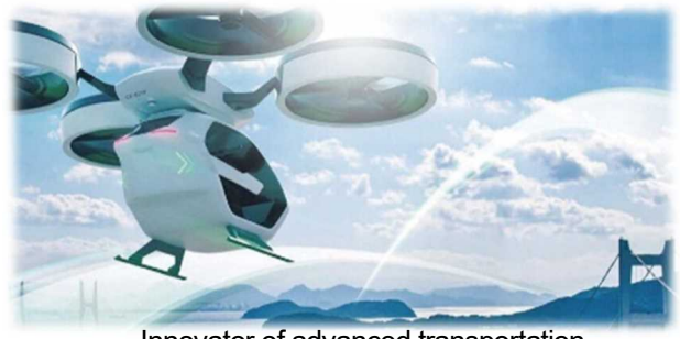
Innovator of advanced transportation